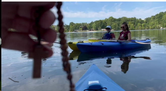
Rosary video found on our FB page and website